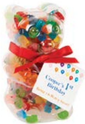
Mini Gummy Bear