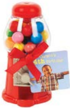
Mini Gumball Machine. (Available in Red, Pink, Blue and White)