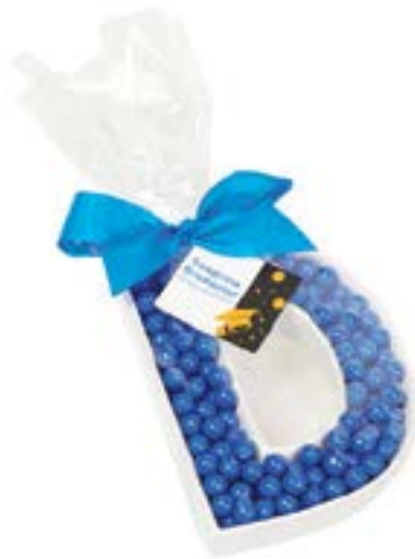
Ceramic Candy Letter