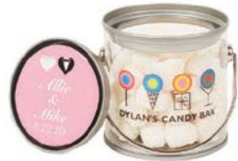
Mini Paint Can