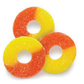
PEACH GUMMY RINGS