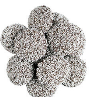
DARK CHOCOLATE NONPAREILS