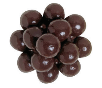
DARK CHOCOLATE MALT BALLS