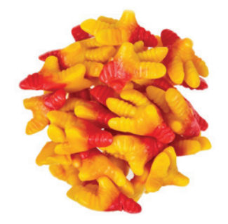
GUMMY CHICKEN FEET