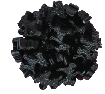
BLACK LICORICE SCOTTIE DOGS