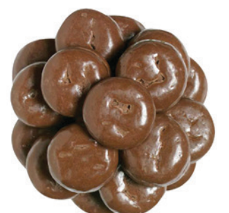
MILK CHOCOLATE SANDWICH COOKIES