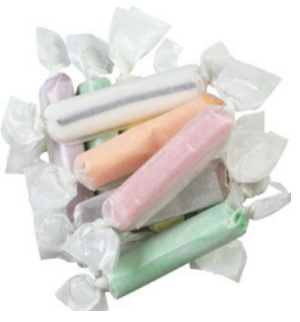
SALT WATER TAFFY