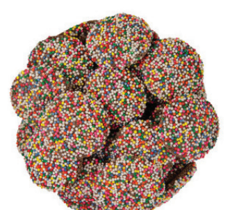
MILK CHOCOLATE NONPAREILS