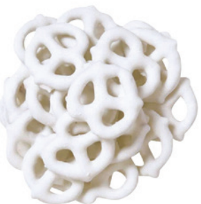
MINI YOGURT PRETZELS