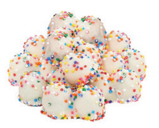
WHITE CHOCOLATE PRETZEL BALLS