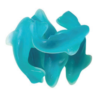
GUMMY MALLOW KILLER SHARKS