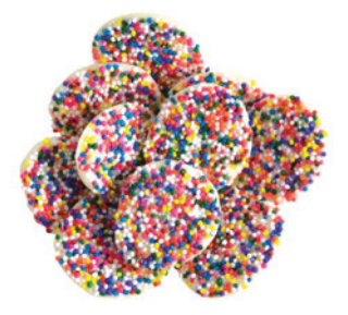
WHITE CHOCOLATE NONPAREILS