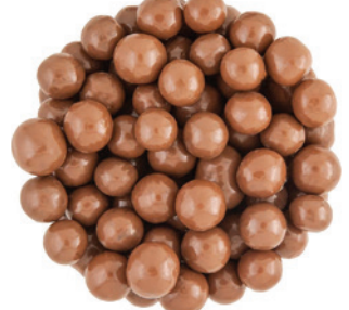
MILK CHOCOLATE COOKIE DOUGH