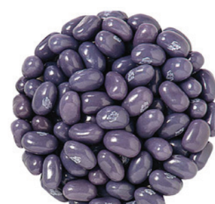
JELLY BELLY ISLAND PUNCH