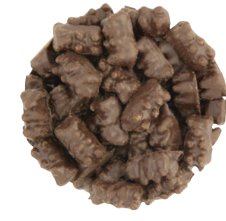
DARK CHOCOLATE COVERED GUMMY BEARS