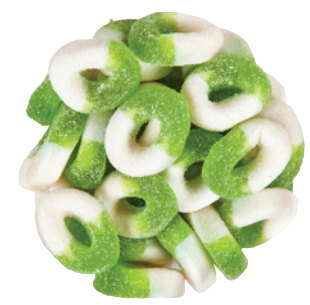
GREEN APPLE GUMMY RINGS