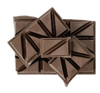
DARK CHOCOLATE COVERED CANDY BAR CHUNKS