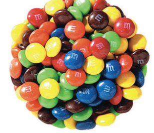
MILK CHOCOLATE M&M'S®