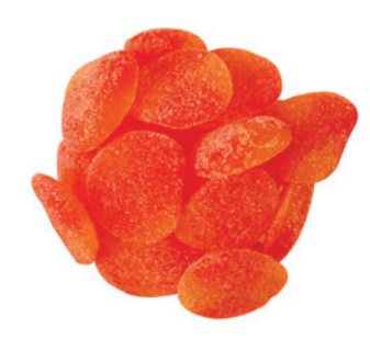
HARIBO GUMMY PEACHES