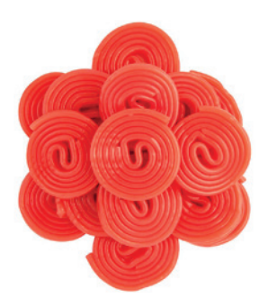
STRAWBERRY LICORICE WHEELS