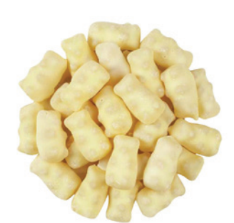
WHITE CHOCOLATE COVERED GUMMY BEARS